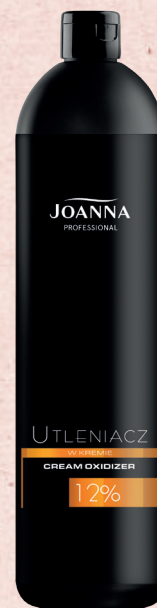
CREAM OXIDIZER 12% 1000 g