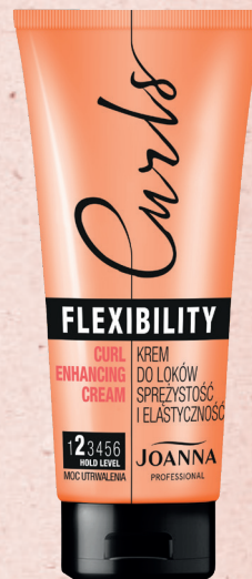
CURLS ENHANCING CREAM 200 G