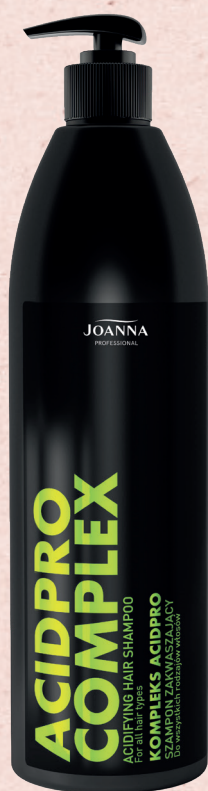
ACIDPRO COMPLEX HAIR SHAMPOO 1000 ML