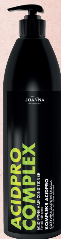
ACIDPRO COMPLEX HAIR CONDITIONER 1000 g