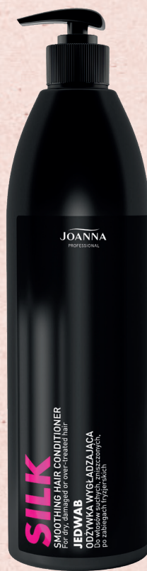
SILK SMOOTHING HAIR CONDITIONER 1000 G