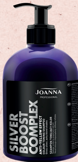
SILVER BOOST COMPLEX HAIR SHAMPOO 500 G