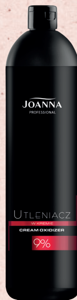
CREAM OXIDIZER 9% 1000 g