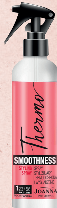
THERMO & SMOOTHNESS 300 ML