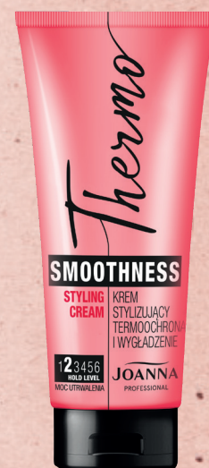
THERMO & SMOOTHNESS CREAM 200 G