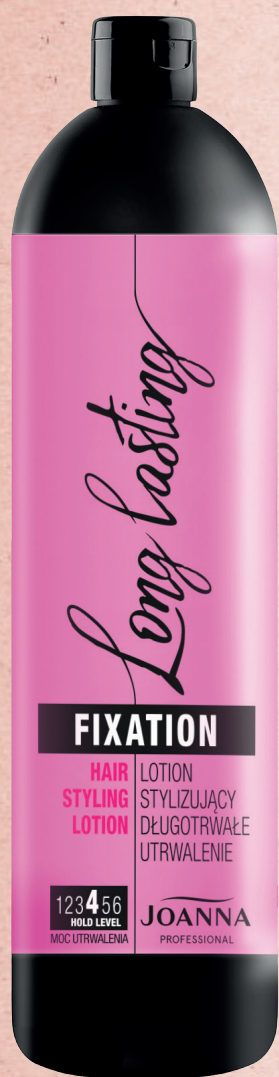
FIXING HAIR STYLING LOTION VERY STRONG 1000 ML