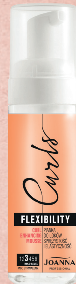
CURLS ENHANCING MOUSSE 150 ML