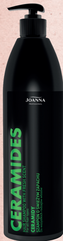
CERAMIDES HAIR SHAMPOO 1000 ML