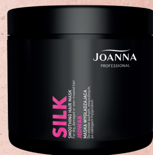
SILK SMOOTHING HAIR MASK 500 G