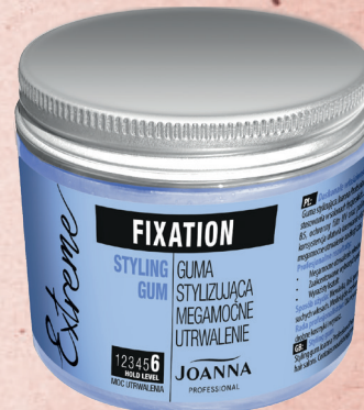
FIXING & STYLING GUM V200 G