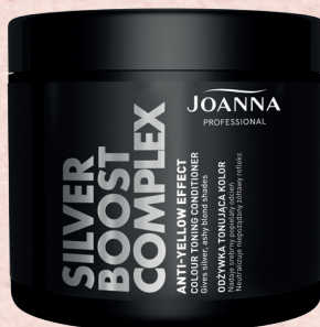
SILVER BOOST COMPLEX HAIR CONDITIONER 500 G