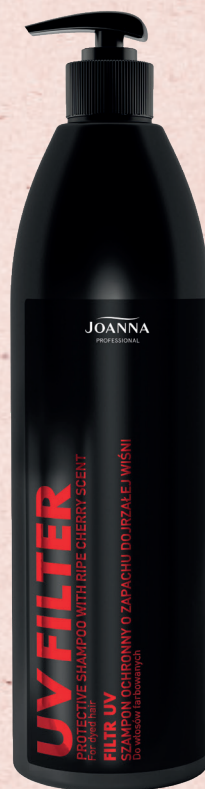
UV FILTER HAIR SHAMPOO 1000 ML