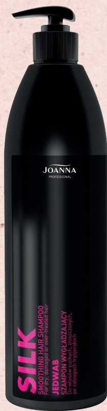
SILK SMOOTHING HAIR SHAMPOO 1000 ML