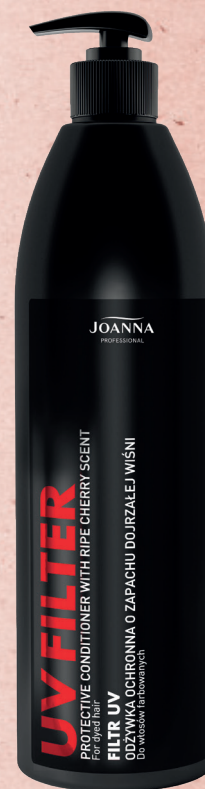
UV FILTER PROTECTIVE CONDITIONER WITH CHERRY FRAGRANCE 1000 ML