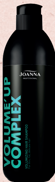
VOLUME UP HAIR SHAMPOO 500 ML