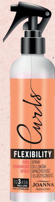
CURLS ENHANCING SPRAY 300 ML