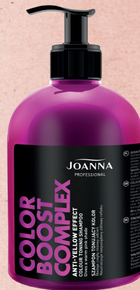
OR BOOST COMPLEX TONING HAIR SHAMPOO 500 G