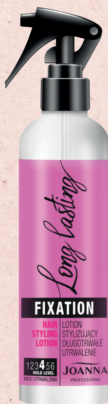
FIXING HAIR STYLING LOTION VERY STRONG 300 ML