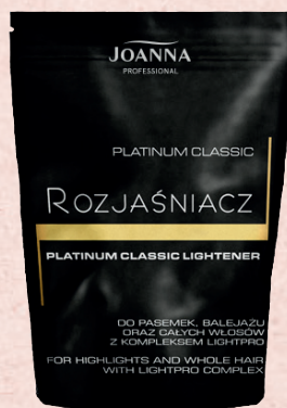
PLATINUM HAIR LIGHTENER 450 g