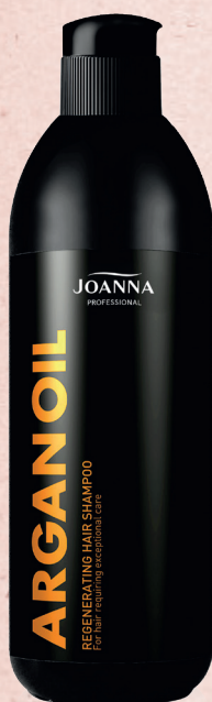
ARGAN OIL REGENERATING HAIR SHAMPOO 500 ML