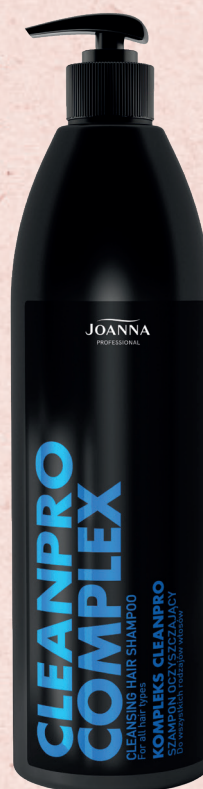
CLEANPRO COMPLEX HAIR SHAMPOO 1000 ML