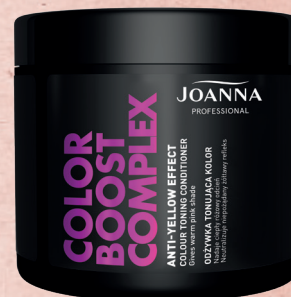
COLOR BOOST COMPLEX TONING HAIR CONDITIONER 500 G