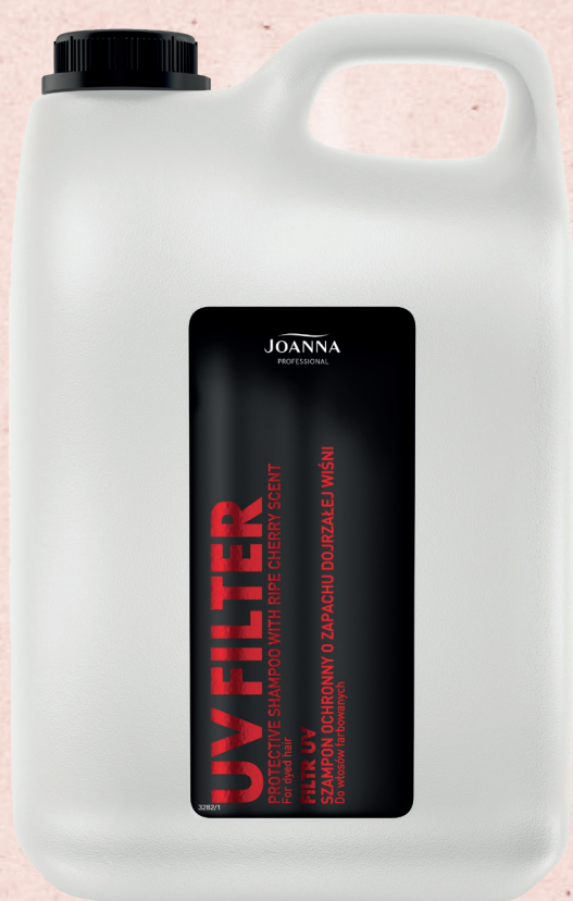
UV FILTER HAIR SHAMPOO 5000 ML