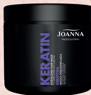
KERATIN REBUILDING HAIR MASK 500 G