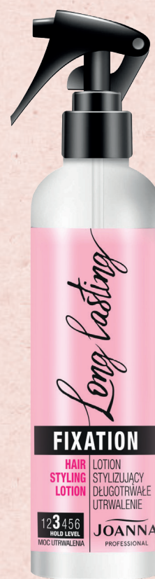
FIXING HAIR STYLING LOTION STRONG 300 ML