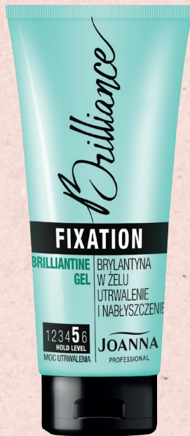
GEL BRILLIANTINE 200 G