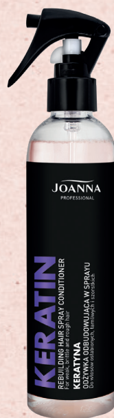
KERATIN REBUILDING HAIR SPRAY CONDITIONER 300 ML