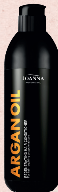
ARGAN OIL REGENERATING HAIR CONDITIONER 500 G