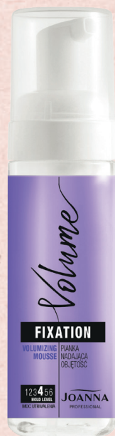
FIXING & VOLUME MOUSSE 150 ML