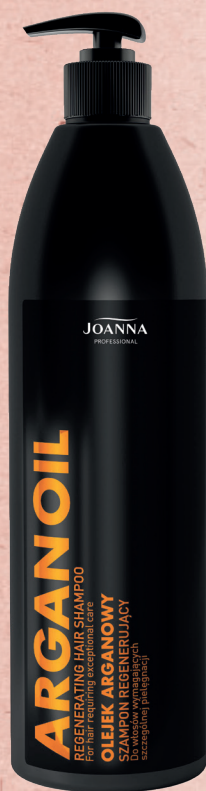
ARGAN OIL REGENERATING HAIR SHAMPOO 1000 ML