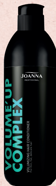
VOLUME UP HAIR CONDITIONER 500 G