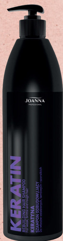
KERATIN REBUILDING HAIR SHAMPOO 1000 ML