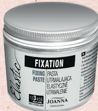
FIXING & STYLING PASTE V200 G