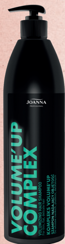
VOLUME UP HAIR SHAMPOO 1000 ML