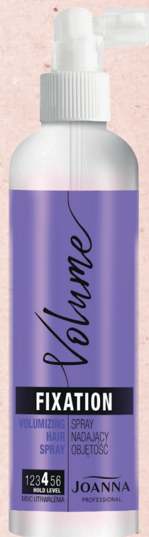
FIXING & VOLUME SPRAY 300 ML