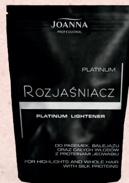
PLATINUM CLASSIC HAIR LIGHTENER 450 g